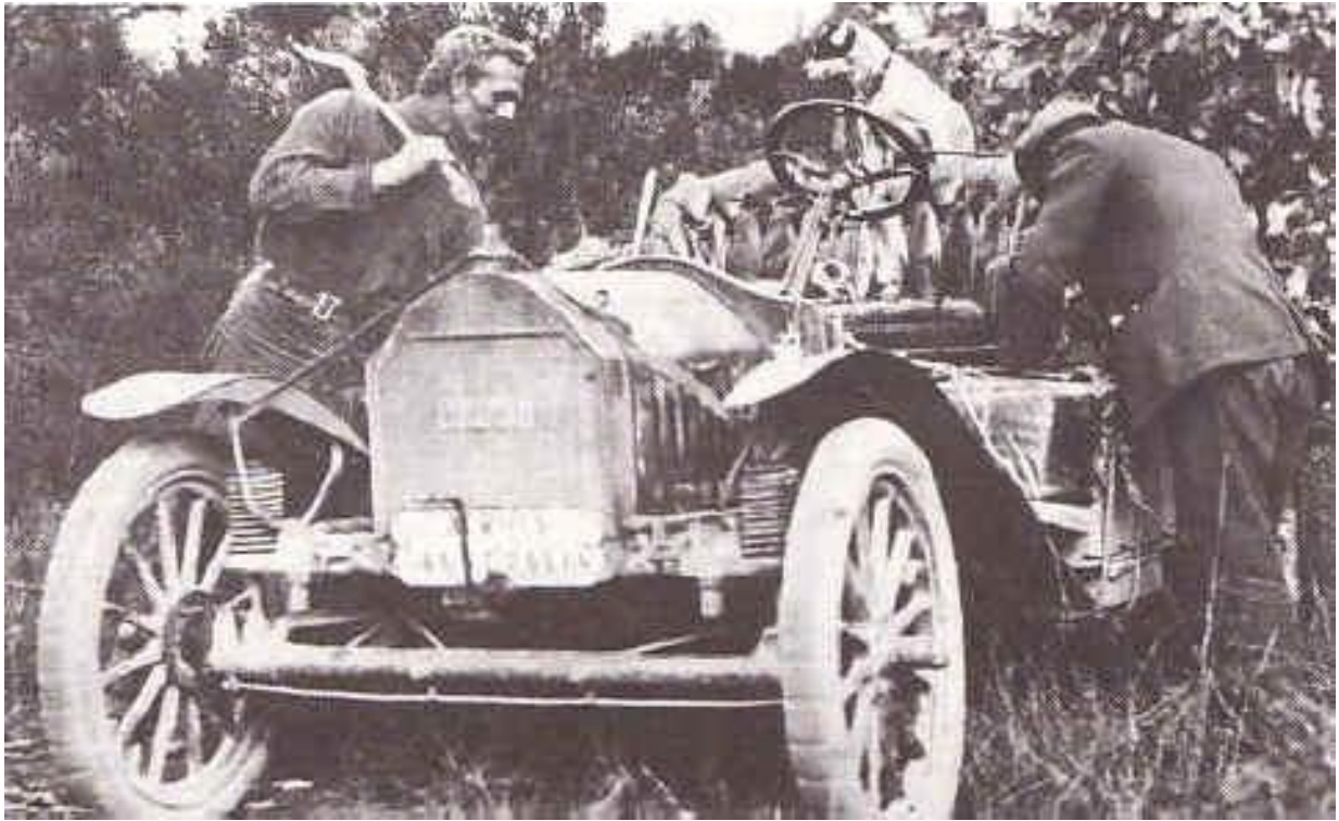
Francis Birtles Sidney Ferguson and Digger on the first crossing of Australia 1912. The trip was re-enacted in the same 1910 Brush in 2012. Note the wooden front axle and coil springs.

Q 1 - Hide all the chairs Q 2 - A spring onion Q 3 - Don't look now I'm changing