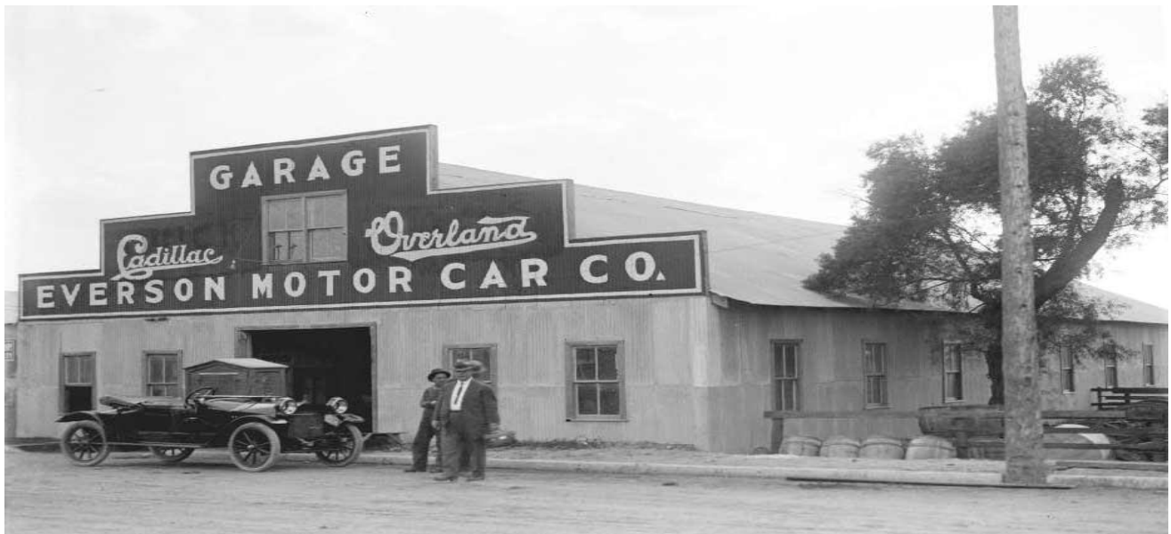
The Cadillac and Overland dealer with a Hupmobile parked in front