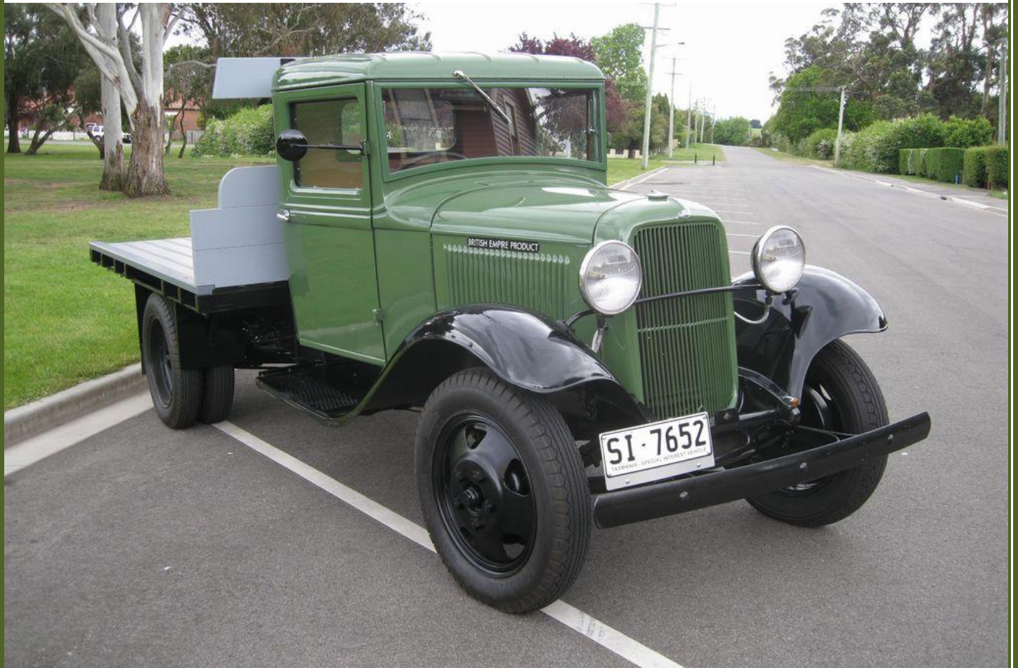
1934 Ford D Truck